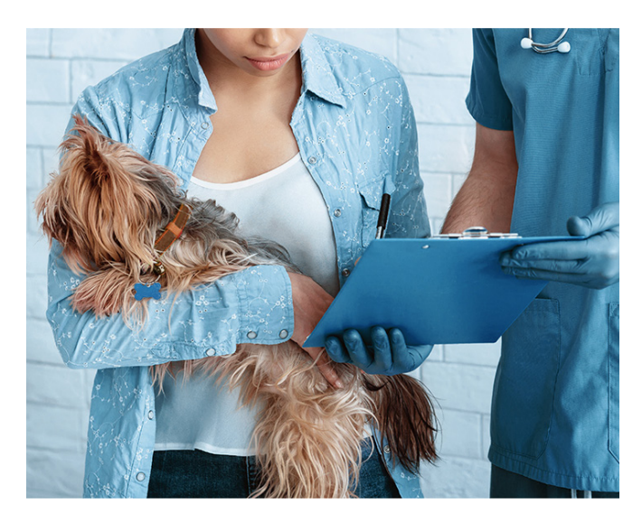
So, I want you to start emphasizing the importance of pet insurance for you .

As interest rates rise, the cash reserve of the average client can be expected to dwindle. We all know the atmosphere in the exam room when you start discussing a patient's diagnosis. That breathless space when you deliver a treatment estimate and the client's expression flashes from concern to panic to anger or sadness. We have all seen the frenzied attempts to make decisions and secure funds. And it wears us down! It gets in our way! It interferes with our purpose as doctors!